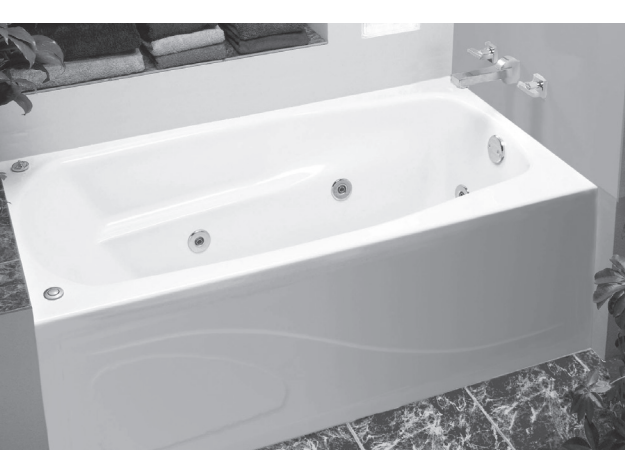
* Tile Flange Skirt (TFS) models feature an integral apron, tile flange and armrests.