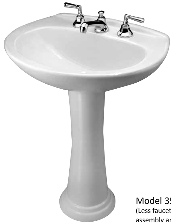
Model 351-8 (Less faucet, drain assembly and supply)