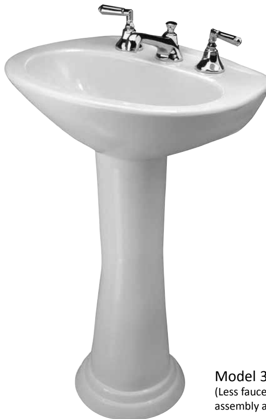
Model 350-4 (Less faucet, drain assembly and supply)