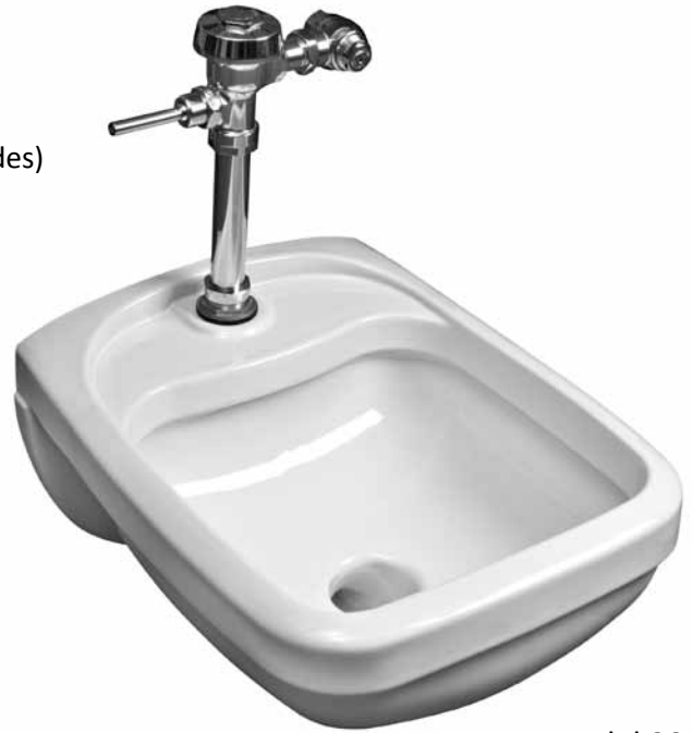
Model 3072 Less flush valve