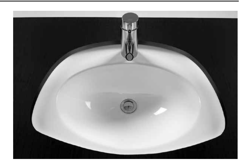
Model 226-1 (Less faucet, drain assembly and supply)