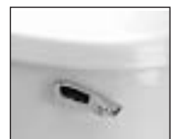
Model 123RH Tank Shown with Model 49 Right Hand Trip Lever