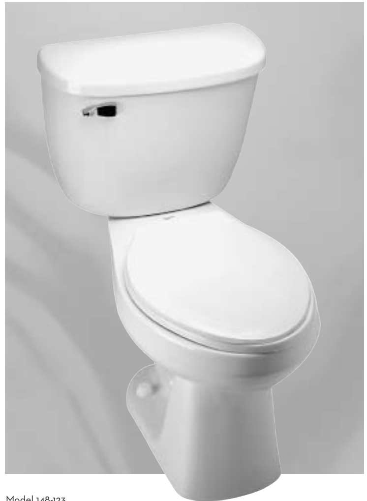
Model 148-123 Shown in White with SB1200 Primo™ Toilet Seat