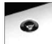
Model 122 Tank Shown with Model 47 Push Button Actuator