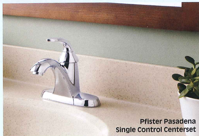
Pfister Pasadena Single Control Centerset