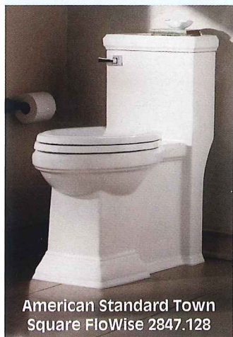
American Standard Town Square FloWise 2847.128

Flow rate is measured in gallons per flush (gpf). In cases where models have dual-flush functionality (a full flush for solids, less for liquids), two measures are provided.