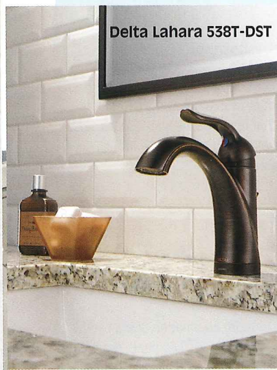
Delta Lahara 538T-DST