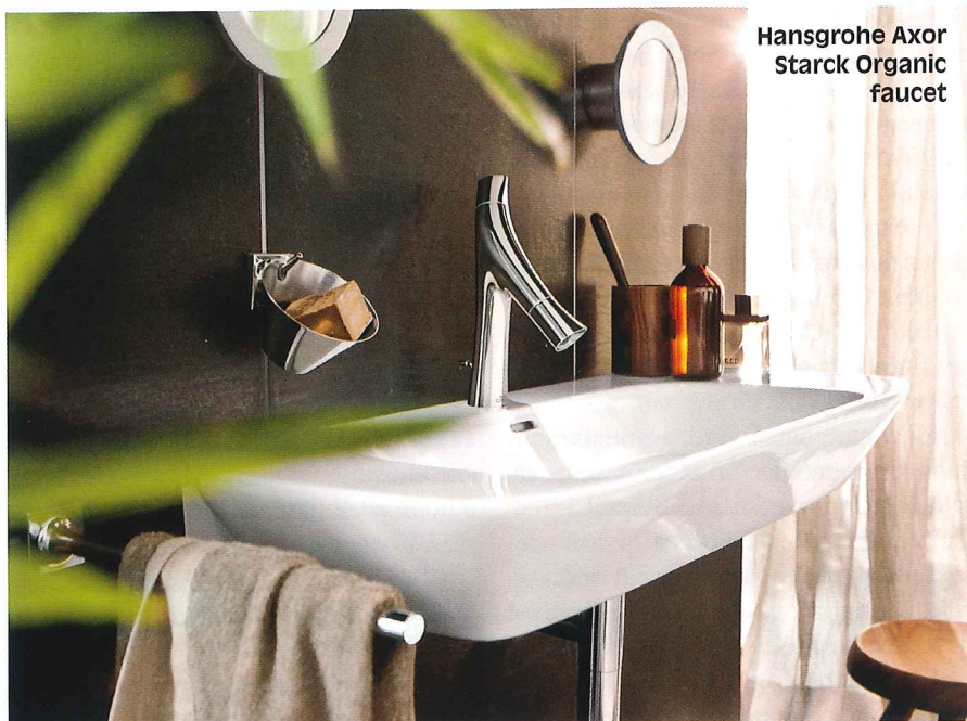
Hansgrohe Axor Starck Organic faucet

Make no mistake: These bathtubs aren't suitable for individuals who have