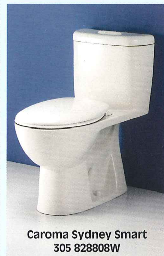
Caroma Sydney Smart 305 828808W

>> No other toilet that's in this price range has such a combination of desirable features as the N2420 does. This model, which is sold exclusively through Home Depot, is the least expensive one-piece,