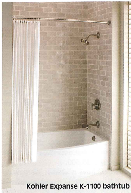
Kohler Expanse K-1100 bathtub

hung toilet are hidden, the overall cost of these models isn't plain to see. Because some of its components are hidden inside of the wall, a wall-hung toilet has higher installation costs than does a standard floor-mounted toilet.