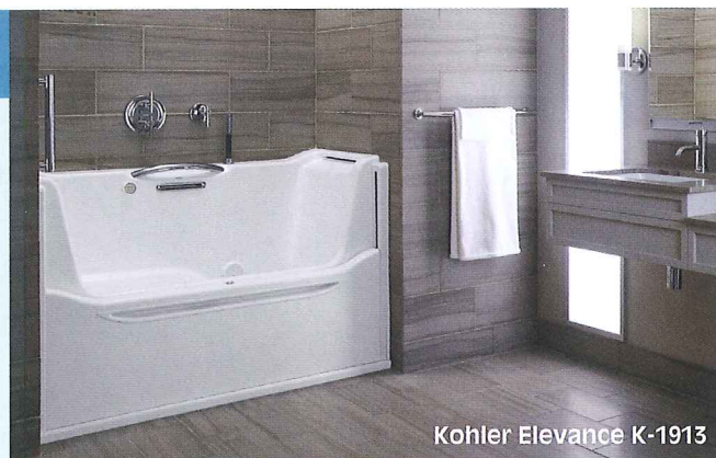
Kohler Elevance K-1913