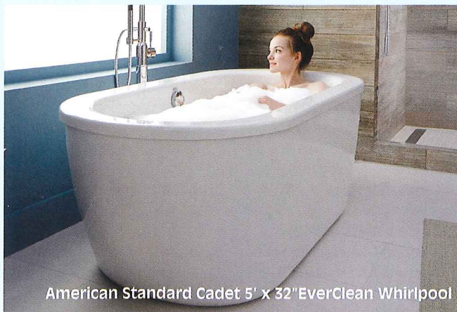
American Standard Cadet 5' x 32" EverClean Whirlpool

For more information about the above Best Buys, contact the manufacturers directly. See page 66.